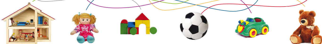
Adéla's favourite toy is a football.

4 Listen and say the name. Poslouchej a řekni jméno. 1.27